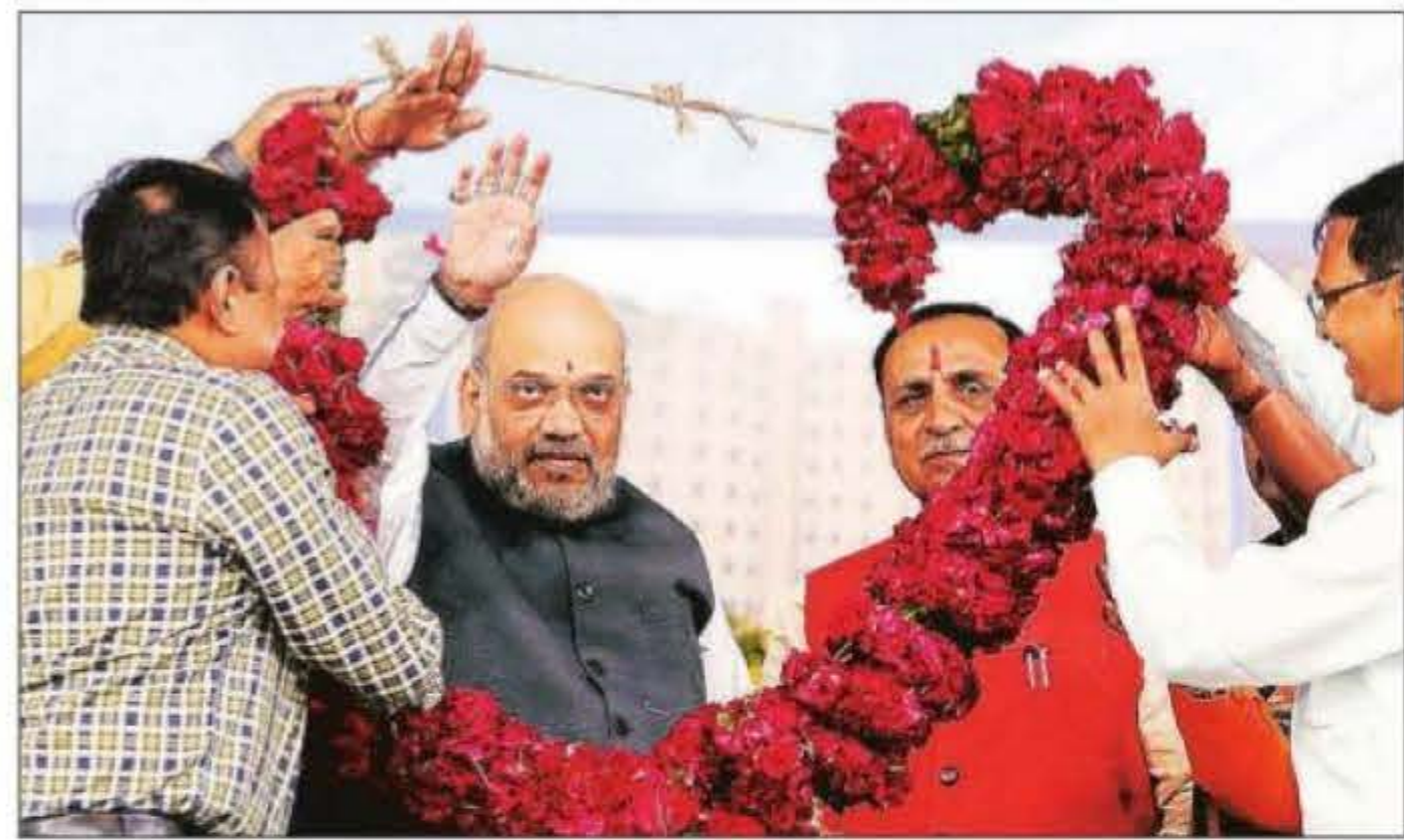
Union Home Minister Amit Shah with CM Vijay Rupani in Ahmedabad on Saturday.

Shah on Saturday laid the foundation stone for and inaugurated several projects helmed by the Ahmedabad Municipal Corporation (AMC) and the Ahmedabad Urban Development Authority. Several municipal corporations in